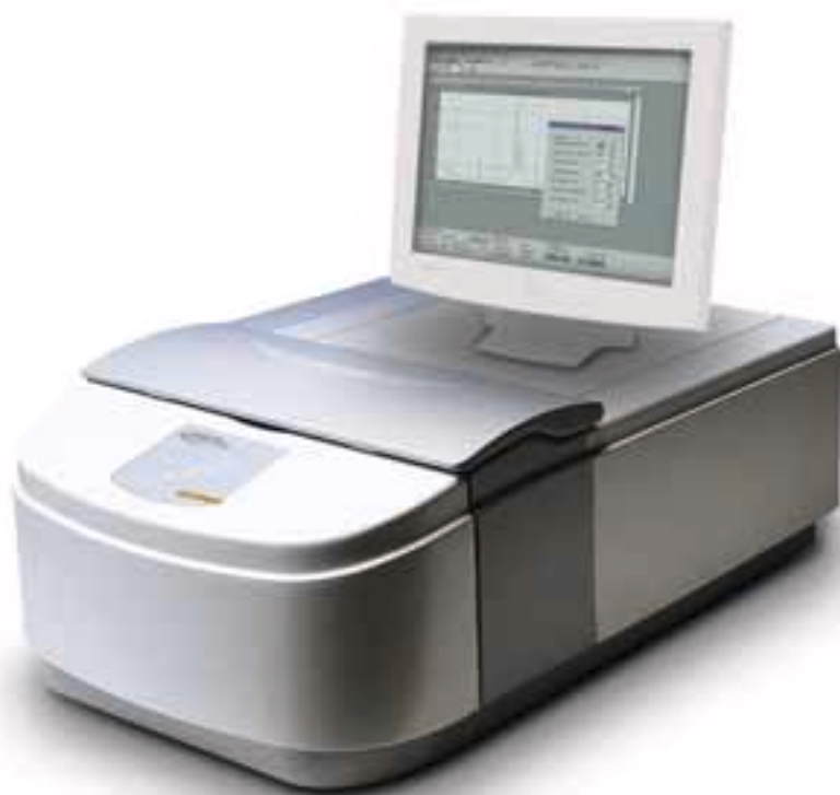
UVIKON XL spectrophotometer*

The UVIKON concept represents the first spectrophotometer serie featuring Advanced Digital Signal Processing technology.